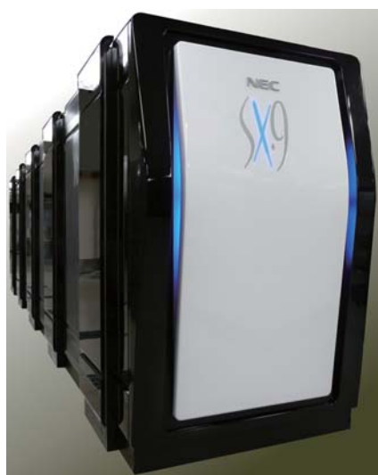
Figure 2-1: NEC SX-9